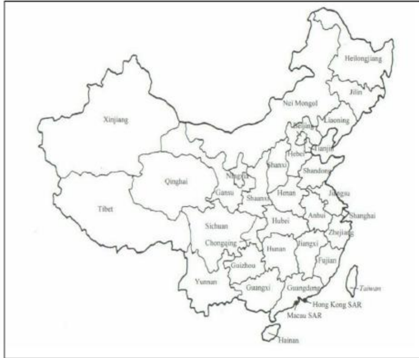
Figure 2a: China's provincial map

Migrants tend to concentrate in large cities. Using census and hukou data, the author has estimated that about half of the population in the four first-tier megacities (Shanghai, Beijing, Guangzhou, and Shenzhen) were migrants in 2020. Detailed, systematic data from the 2010 census also show that 44 percent of the population in cities with over 5 million people were migrants; three-fourths of them held a rural hukou and were thus predominately rural-to-urban migrants (Chan and Yang 2019; Zhao 2014). Women made up 47 percent of all migrants in 2010 and men accounted for 56 percent of long-distance migrants crossing provincial boundaries (Deng 2014).